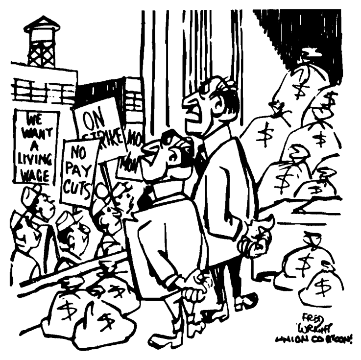
"All they think about is money."

need for development, they must be an expression of the autonomous needs of the class. In the heat of the struggle, the true separation between labor power and working class reaches its most threatening revolutionary peak. "It is quite precisely the separation of the working class from itself, from itself as wage labor, and hence from capital. It is the separation of its political strength from its existence as an economic category." (Tronti)